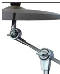
Fully adjustable boom arm cymbal stand