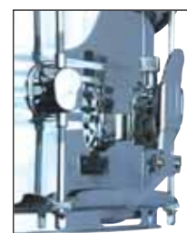
Adjustable throw-off snare strainer