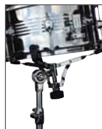
Heavy-duty, quick-release basket snare