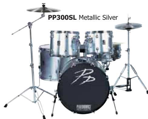
PP300SL Metallic Silver