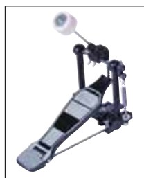
Single chain drive split plate bass pedal with retractable spikes