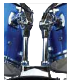
Fully adjustable tom arms with memory locks