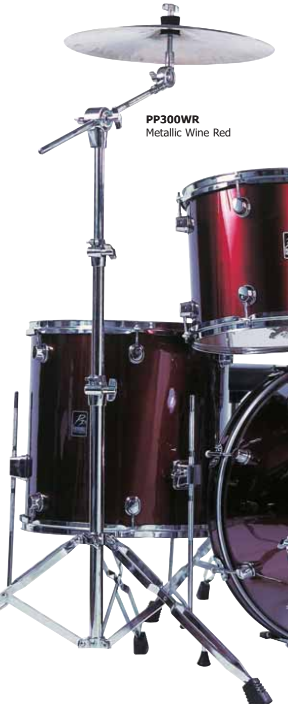
PP300WR Metallic Wine Red

There were some very pleasant surprises in terms of hardware. Double-braced legs were provided throughout on the boom cymbal stand, hi-hat stand, snare stand