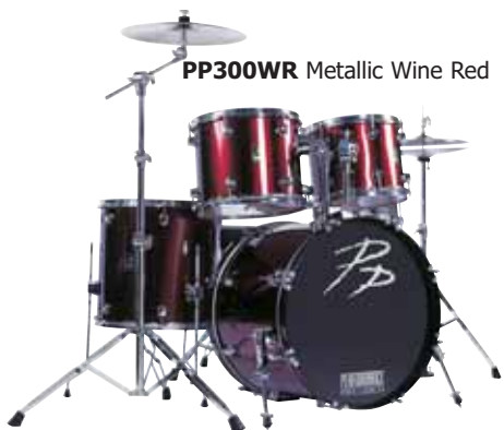
PP300WR Metallic Wine Red