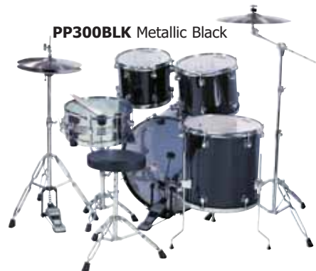
PP300BLK Metallic Black