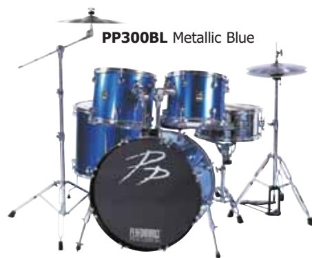
PP300BL Metallic Blue