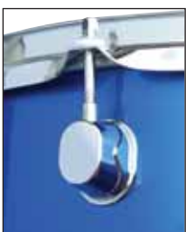
Classic design drum lug