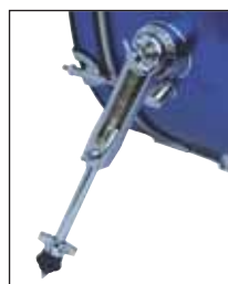
Spike/rubber spurs with setting markers