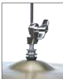
Rock-solid hi-hat clutch