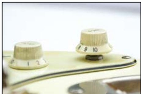
The Bukka switch kicks in a hum-cancelling dummy coil

an extremely neat set of 21 well honed frets, offers one of the best replicated vintage necks we've played in an age. The tighter vintage style fingerboard radius suits the natural curve of the player's left hand and feels spot-on for chord work and lead playing, as specified by Thomas himself.