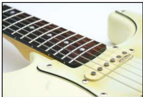
The 7.25-inch fingerboard radius maintains the vintage feel

this guitar has captured a lifetime's worth of the sweat and toil of a hard-pushed, working guitar.