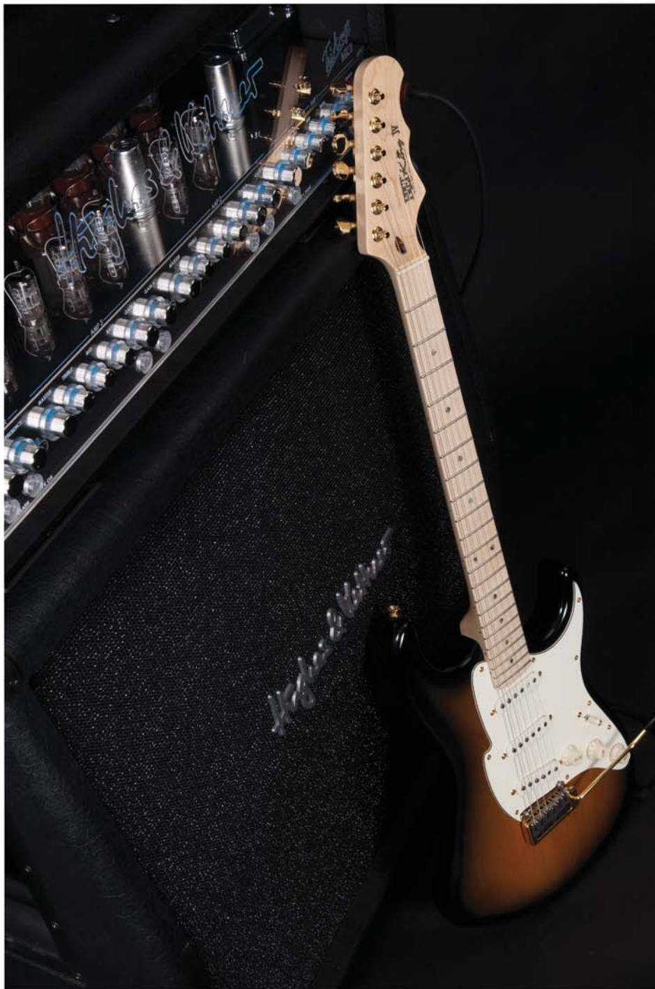
Fret-King's Corona JV P20

Choice cuts from the mid-high-end market