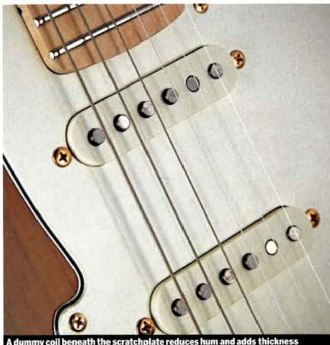
A dummy coil beneath the scratchplate reduces hum and adds thickness