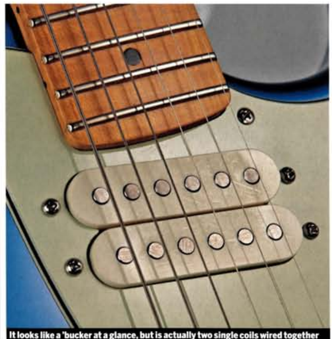
It looks like a 'bucker at a glance, but is actually two single coils wired together