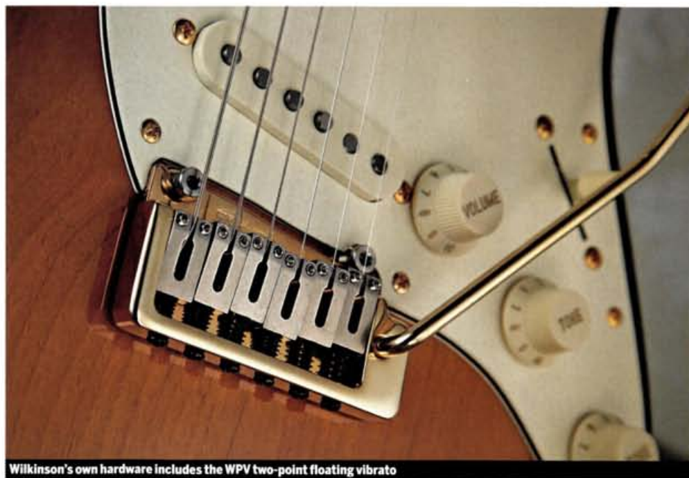
Wilkinson's own hardware includes the WPV two-point floating vibrato