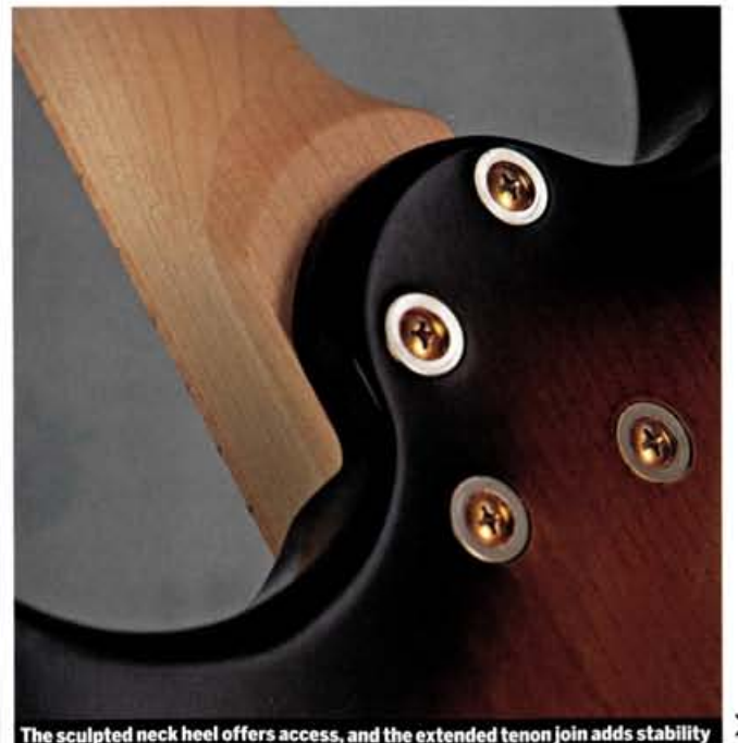
The sculpted neck heel offers access, and the extended tenon join adds stability