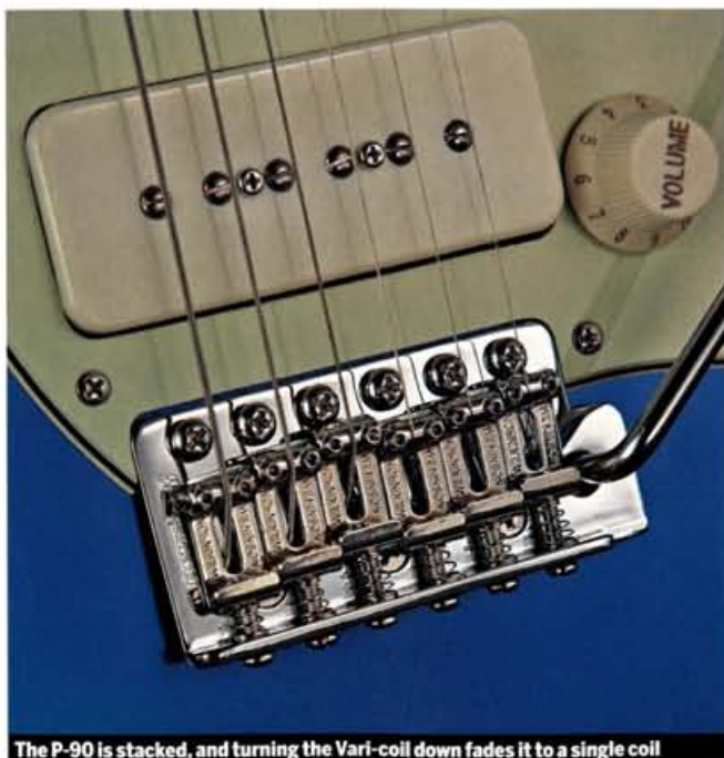
The P-90 is stacked, and turning the Vari-coil down fades it to a single coil

even heftier. The bridge P-90 is fat and full of colour but remains articulate, even with a Boss Blues Driver kicked in. Flip across to the neck single coil and it's the sound you'd automatically expect, but in no way dwarfed by the size of the P-90. With both neck pickups on things get even bigger; clean, the tone is warm but with no fuzzy edges, and with the Driver engaged it arrives somewhere between Clapton's signature boost and Gary Moore's Still Got The Blues . If it's Texas blues you want, try the middle position; this selects one neck single coil along with the bridge P-90 for a lovely balance of warmth and cut, especially when using the Vari-coil to dial a smidge of humbucker out. All the pickups sound individually great, but position 2 (bridge and middle together) is now more baritone than tenor; knock back the tone pot, kick in the Blues Driver and you're in Schenker City! There's so much here it's not true, from power rock to funky blues, and